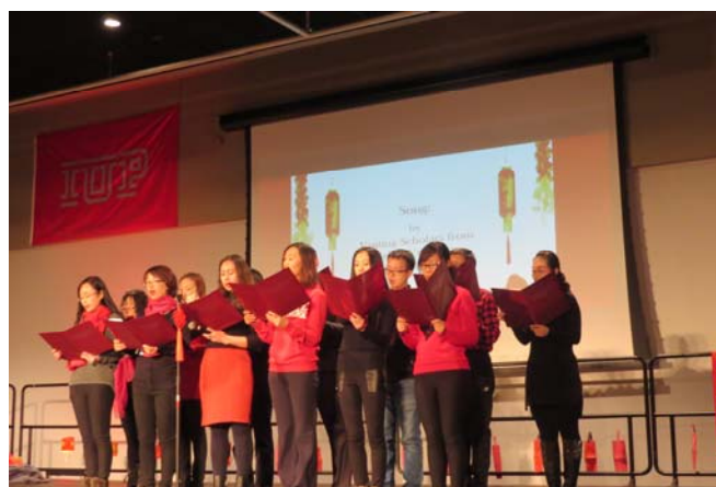
Performance by visiting scholars from Hebei University, China