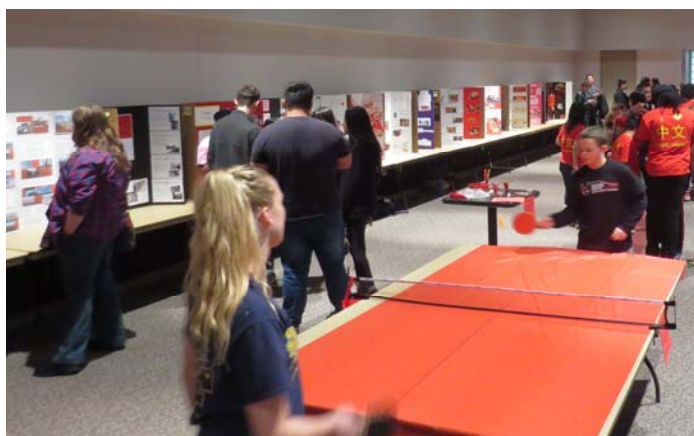
Above: Ping-Pong table