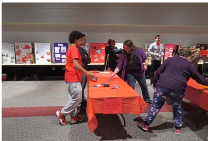
Above: Chopstick competition