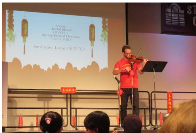
A student playing a Chinese music piece