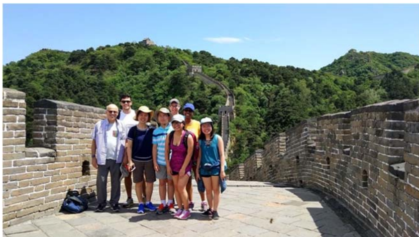
Above: Faculty and students of the Silk Road Program at Great Wall (the Mutianyu 慕田峪 section)