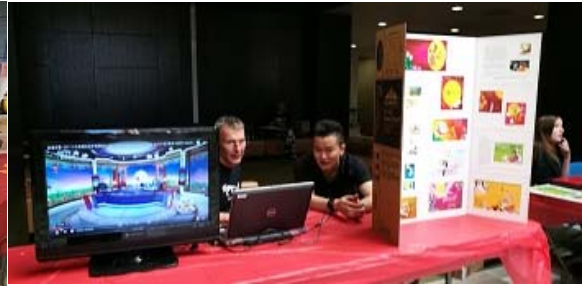
Above: Showing videos on the festival