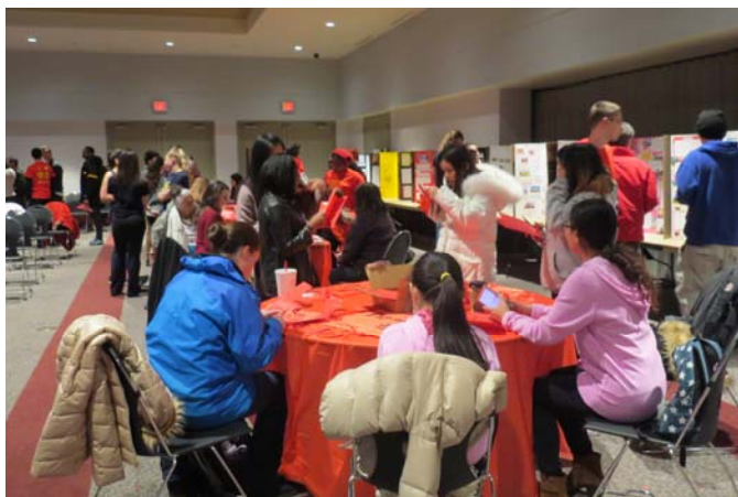
Above: Papercut table