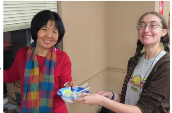
Below: A student participant tasting a piece of the fried glutinous cake.