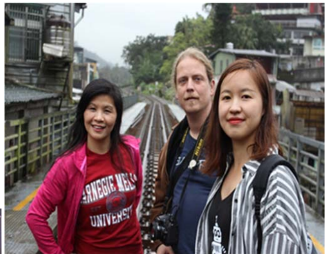
Right: Pictured at Pingxi railway, 平溪鐵道 after visiting 平溪十分老街