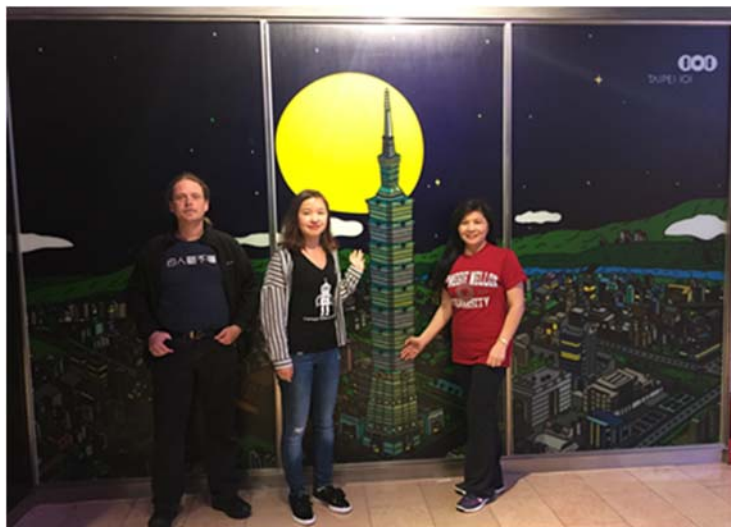
Left: Visiting Taipei 101 台北101