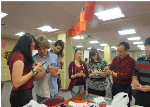
Left: Participants learning how to make Yuanxiao.