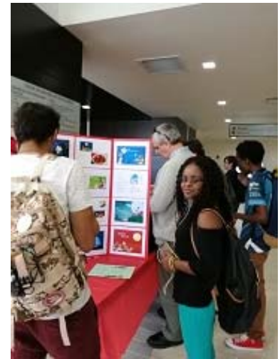
Above: Participants at the event