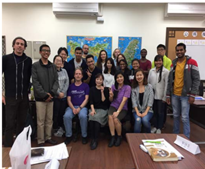
Above: Picture taken with students and faculty after observing a CLC class

Learning Activities: with the 月涵學堂 of 清華大學中國文學系 and the 華語中心 NTHU Chinese Language Center (CLC) help, they attended workshops which mainly focused on special features of CFL, grammar structures & How to teach CFL Writing. They also visited some of the Chinese classes at the Chinese Language Center (CLC) 清華大學華語中心 and had a great experience interacting with the CFL Chinese faculty and students there.