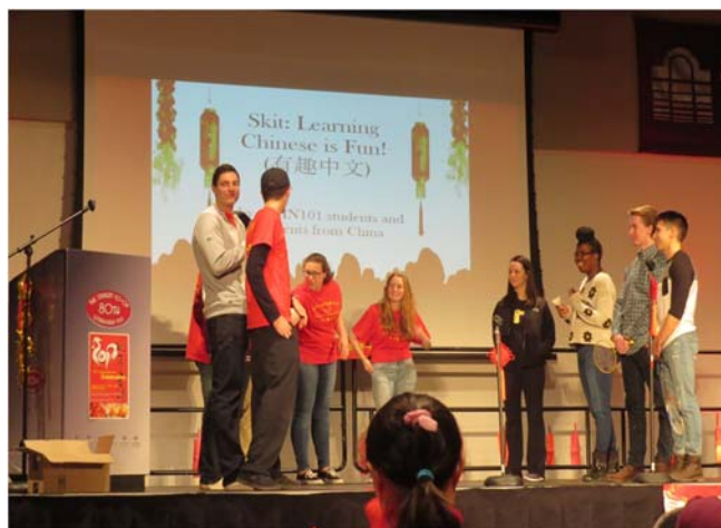
CHIN101 students performing a Chinese skit