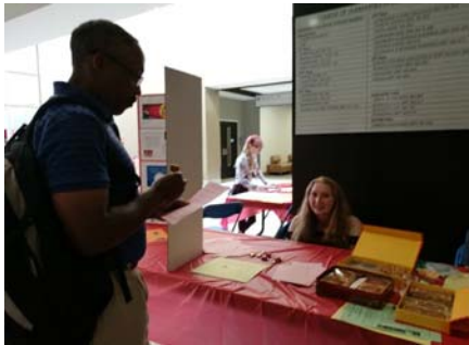
Right: Participants at the event